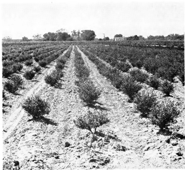
Ilex crenata rotundifolia Photographed Sept. 6, 1952